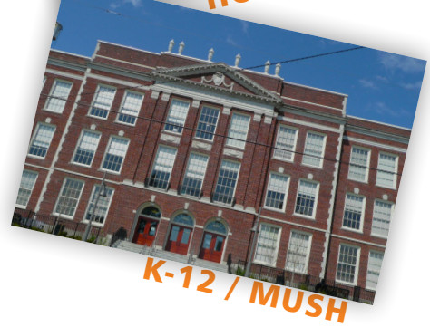
K-12 / MUSH